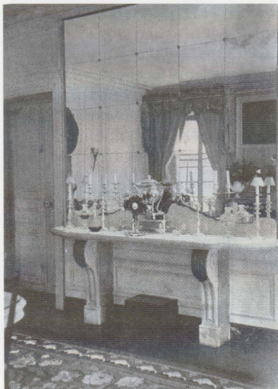
FROM THE HOUSE IN GOOD TASTE, 1913

De Wolfe was a proponent of mirrors because they reflect light and can dress up a room.