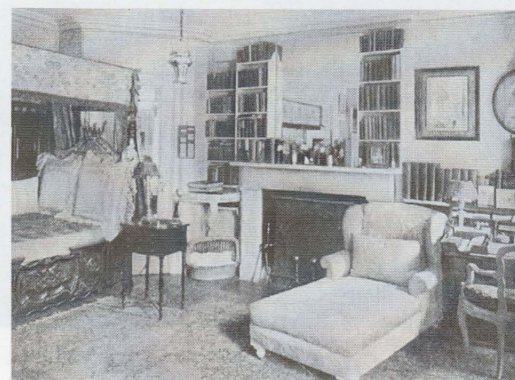
De Wolfe understood the importance of incorporating comfortable chairs to make people feel at home.