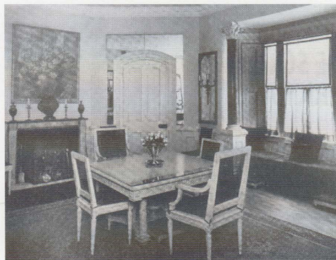
FROM THE HOUSE IN GOOD TASTE, 1913

De Wolfe was a proponent of mirrors because they reflect light and can dress up a room.