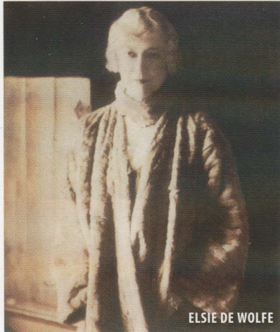
FROM THE HOUSE IN GOOD TASTE, 1913